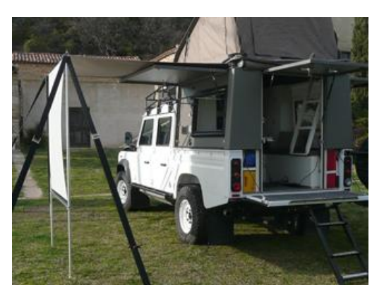
Travel vehicle 4x4 Land Rover type Defender 130 with living space and video projection equipment