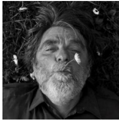
Gérard FRANCOIS Globetrotter - Photographer