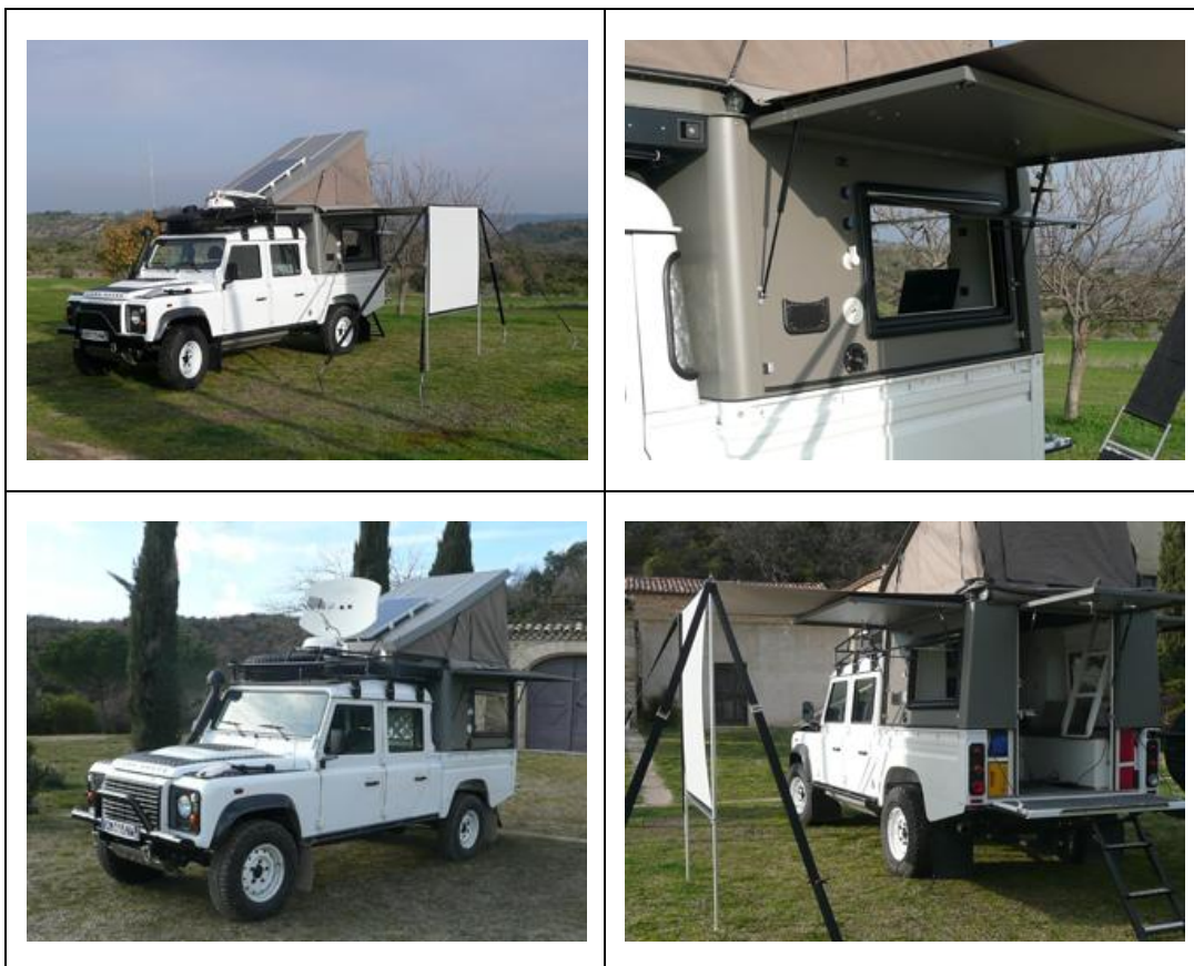
Travel vehicle 4x4 Land Rover type Defender 130 with living space and video projection equipment

The vehicle is equipped with two extra fuel tanks, another one for 100 liters of water, a shower, a chemical toilet, heavy duty shocks and suspension, a solar panel, a generator, an antenna to pick up the Internet via satellite and all the electrical equipment for editing and video projection. The vehicle allows four people to travel safely. Even if Gérard FRANCOIS travels mostly alone, he can also welcome friends or members of his family to share a part of the journey with him.